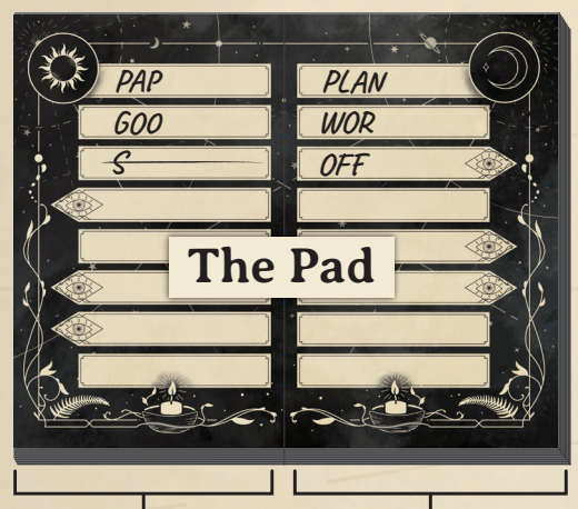
Sun team's side Moon team's side

Add more Mediums to each team. Mediums on a team share their hand of cards, work together, and can pass secret notes. Any of them can call "Silencio."