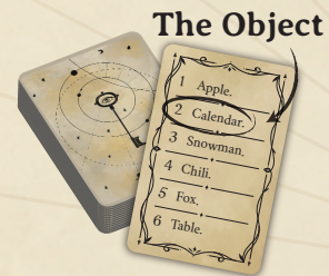
50 Object Cards