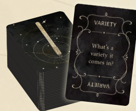
100 Question Cards